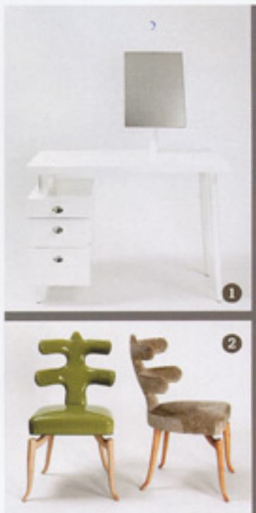
1. The Angles' furniture line, available at aquavivadesign.com , includes the Lacquer Vanity with mirror. 2. The Arc Dining Chairs are based on human vertebrae. 3. The S Chaise is inspired by the curvy line of a classic Cabriole table leg. 4. The Wingback Chair was designed to seamlessly fit the shape of the human body.