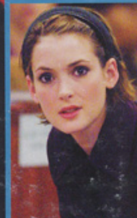
WINONA RYDER Did she steal before?