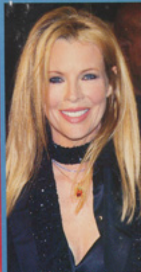
KIM BASINGER After Alec: 8 Mile 's reclusive star